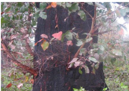
Image 2: Eucalypt resprouts help recover carbon lost in fires