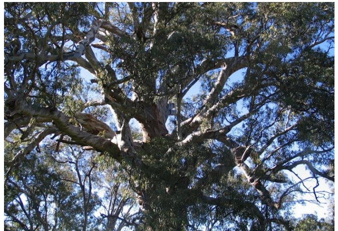
Image 1: Large trees store most of Victoria's forest carbon

The project will provide a platform for examining the influence of different management scenarios on Victoria's ever-changing forest carbon stores. An IFER Carbon Supplementary project: Integrating Carbon into Modelling Frameworks for Bushfire Risk Management Reporting , will also improve DELWP's capacity to explicitly compare carbon alongside other forest values in annual fuel management reports.