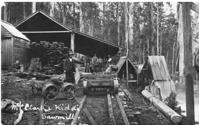
The first sawmill to operate in the Rubicon forest in 1907.

The Rubicon Valley Historic Area has been set aside for the protection of the area's historic sites and values. Timber harvesting was historically the major industry of the region, beginning in the early 1900's. Eight sawmills were operating in the Rubicon forest in the first half of the century.