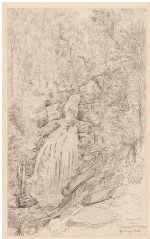
An early sketch of Snobs Creek Falls, then known as Bunyarrambite Falls, by Eugene von Guerard.

Prior to European settlement, the local Taungurong people referred to the falls as 'Bunyarrambite', which is believed to mean 'be against water' or 'twilight water'. In the early 1860's, Snobs Creek was also known as Cataract Creek, but is rumoured to have later changed to 'Snobs' after 'Black' Brooks, a West Indian man who operated a bootmakers shop in close proximity to the creek and present highway. Snob is an old English term used to describe a bootmaker or boot repairer.