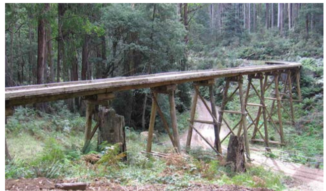
15000' Siphon trestle bridge, named because of its distance in feet from the beginning of the tramline at the top of the haulage, has been reconstructed to original specifications

A 1.3 km haulage, with an average grade of 1 in 3, from the Rubicon Power Station to the top of the spur, still exists today. A steel tramway used to maintain the aqueduct between the Rubicon Power Station and the Rubicon Dam was in operation until the mid 1990's when All Terrain Vehicles (ATV) took over the work of the tramcars. Three impressive trestle bridges form part of the tramway at Lubra Creek, Beech Creek and at the Fifteen Thousand Foot Siphon. A fourth trestle bridge is located at Royston Power Station. While still in operation today, public access to the power stations and associated infrastructure is not permitted.