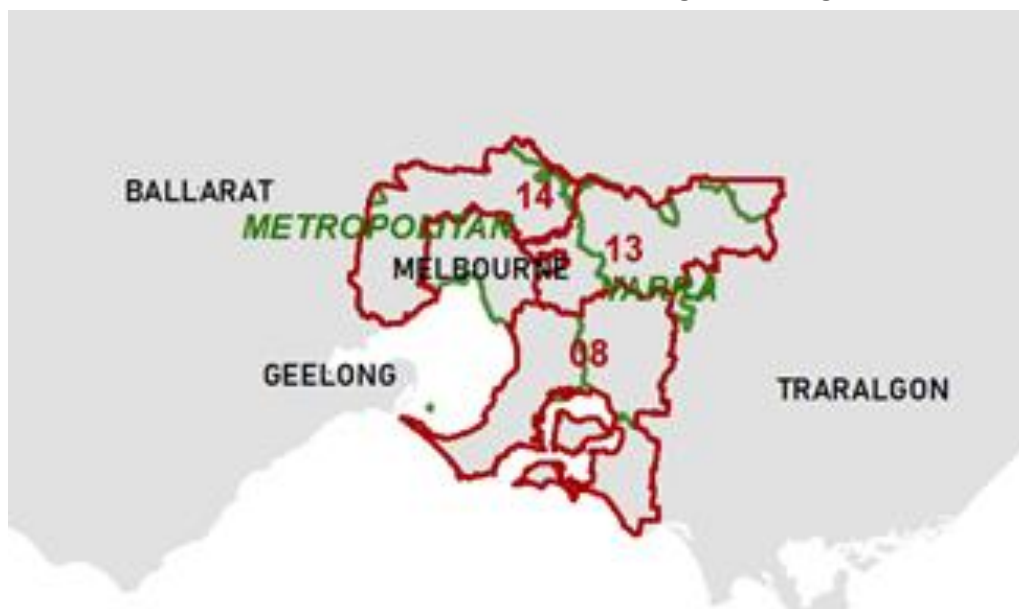
Map 1: FFMVic and CFA Districts included on this Joint Fuel Management Program

The JFMP is prepared and will be implemented in accordance with Safer Together: A new approach to reducing the risk of bushfire in Victoria , the Code of Practice for Bushfire Management on Public Land 2012 the Metropolitan Regional Bushfire Management Strategy and relevant CFA and FFMVic Instructions, Manuals and Guidelines.