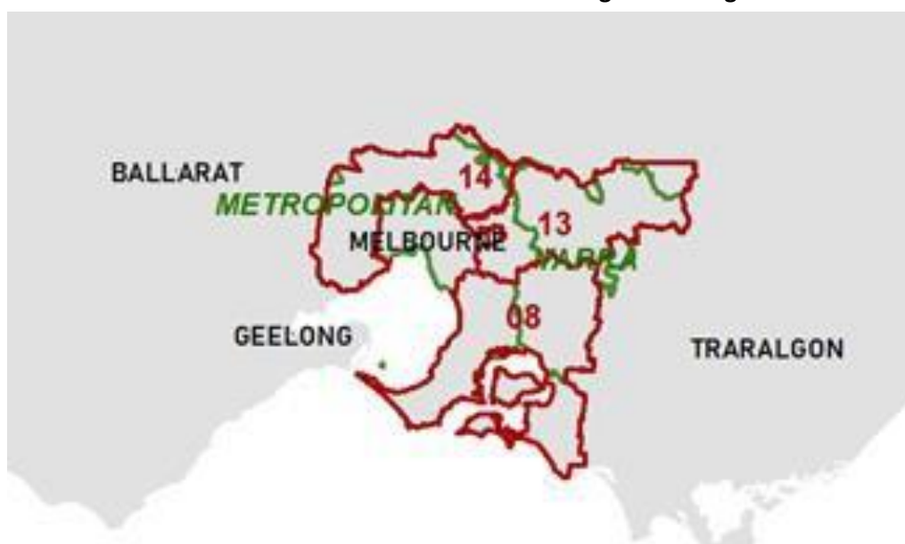
Map 1: FFMVic and CFA Districts included on this Joint Fuel Management Program

The JFMP is prepared and will be implemented in accordance with Safer Together: A new approach to reducing the risk of bushfire in Victoria , the Code of Practice for Bushfire Management on Public Land 2012 the Metropolitan Regional Bushfire Management Strategy and relevant CFA and FFMVic Instructions, Manuals and Guidelines.